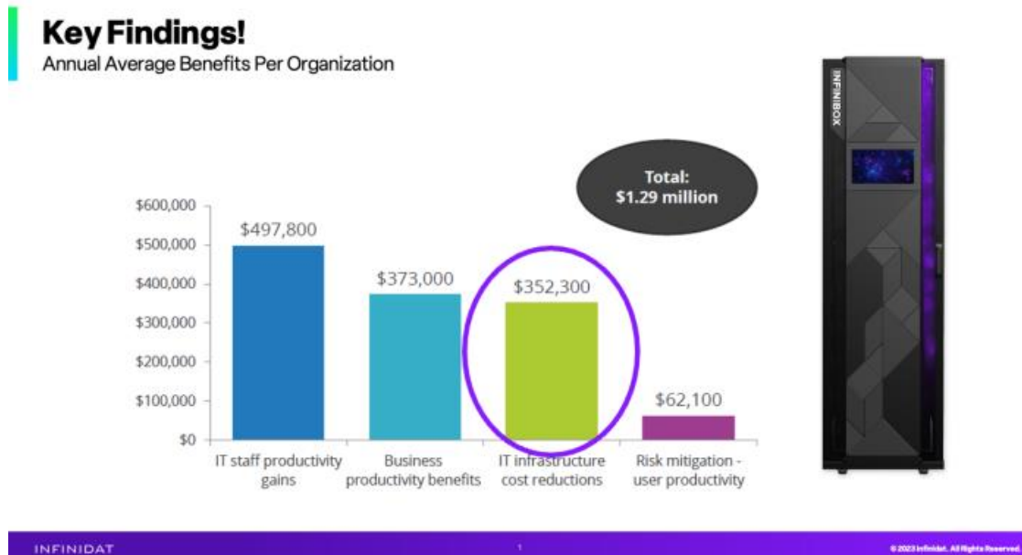
(Figure 1 - Annual Average Benefits per Organization - Business productivity benefits highlighted)

IDC quantified the value that the study's participants received at an average annual benefit of $1.29 million over five years (see Figure 1). IDC further calculated that adoption would yield annual benefits of $166,900 per PB of storage capacity.