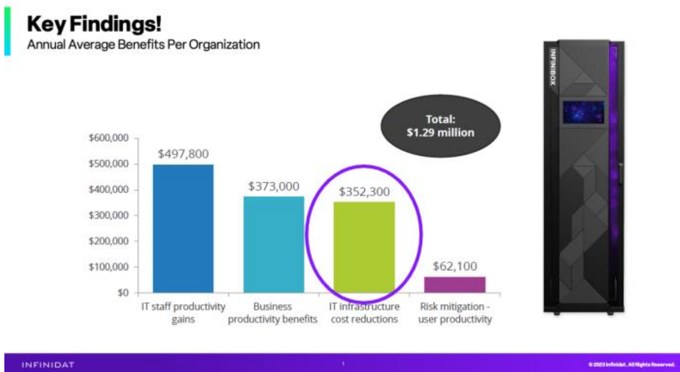
(Figure 1 - Annual Average Benefits per Organization - Business productivity benefits highlighted)

IDC quantified the value that the study's participants received at an average annual benefit of $1.29 million over five years (see Figure 1). IDC further calculated that adoption would yield annual benefits of $166,900 per PB of storage capacity.